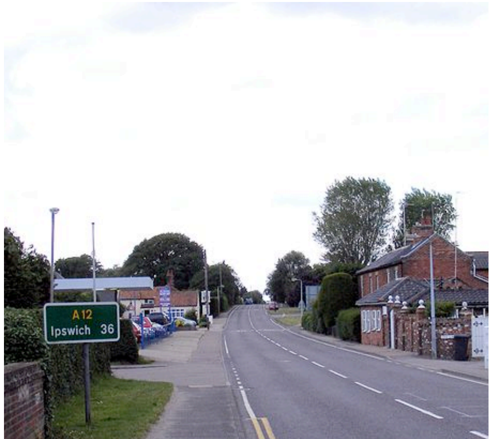
Heading east on the A12.

This is a short book. I have not come across anything like it (though it may exist), in particular because each story varies a few variables and it is made clear to the reader what these are. You can see a vision of how these particular trends may play out—and what Suffolk will look and feel like if a trend plays out one way or another. In writing a book in this way, I